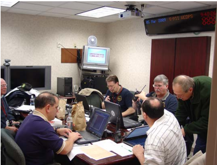
SIMCELL Operations during WeatherEx 2009