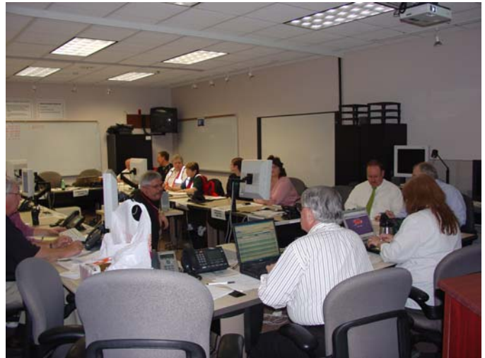
EOC STAFFED TO ECON LEVEL 2

Over 320 entries (not including the checklist items) were logged into the Knowledge Center "Parent" Event and the 23 "Child" Events that were created as the exercise developed.